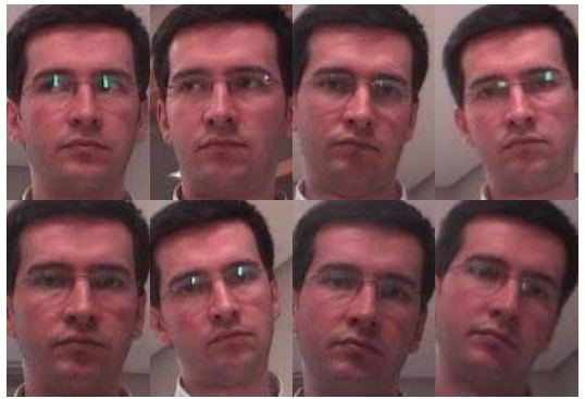
Fig. 3. Images of a user.

After that, using the previous database compares the face obtained with faces stored in database using PCA. With this information the user is recognized. If the system does not recognize the user, ask for his name and introduced a set of faces of him in the database and the database is trained again. This way, the system stores all users and the database is increased on-line.