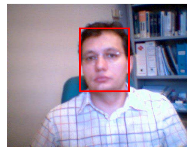
Fig. 5. Face detection.