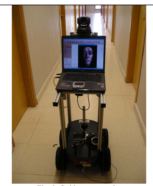
Fig. 8. Guidance example.