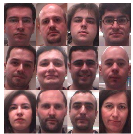
Fig. 4. Images from different users.