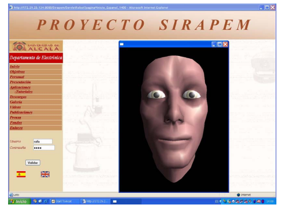
Fig. 1. Social interaction interface.

We are working to develop a robot that permits a natural human-robot interaction. To do this, we have focused our work in develop a dialogue as a join process of communication among human and robot. This involves sharing information using "spoken dialogs" or "pressing the screen", transmission of emotions and perception of the world [3].